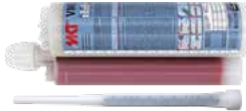
Cartridge VME plus 440 Side-by-side cartridge Content: 440ml